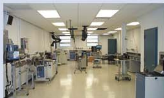
C.W. Brabender® laboratory