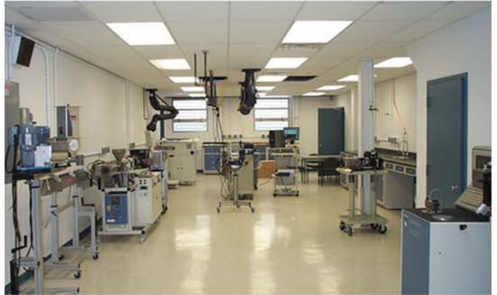
C.W. Brabender® laboratory

Together we will find the optimal solution to meet your testing needs.