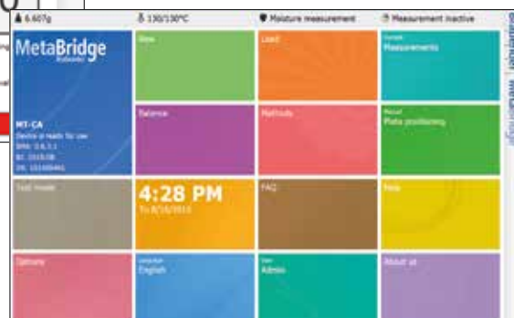
Clear start screen